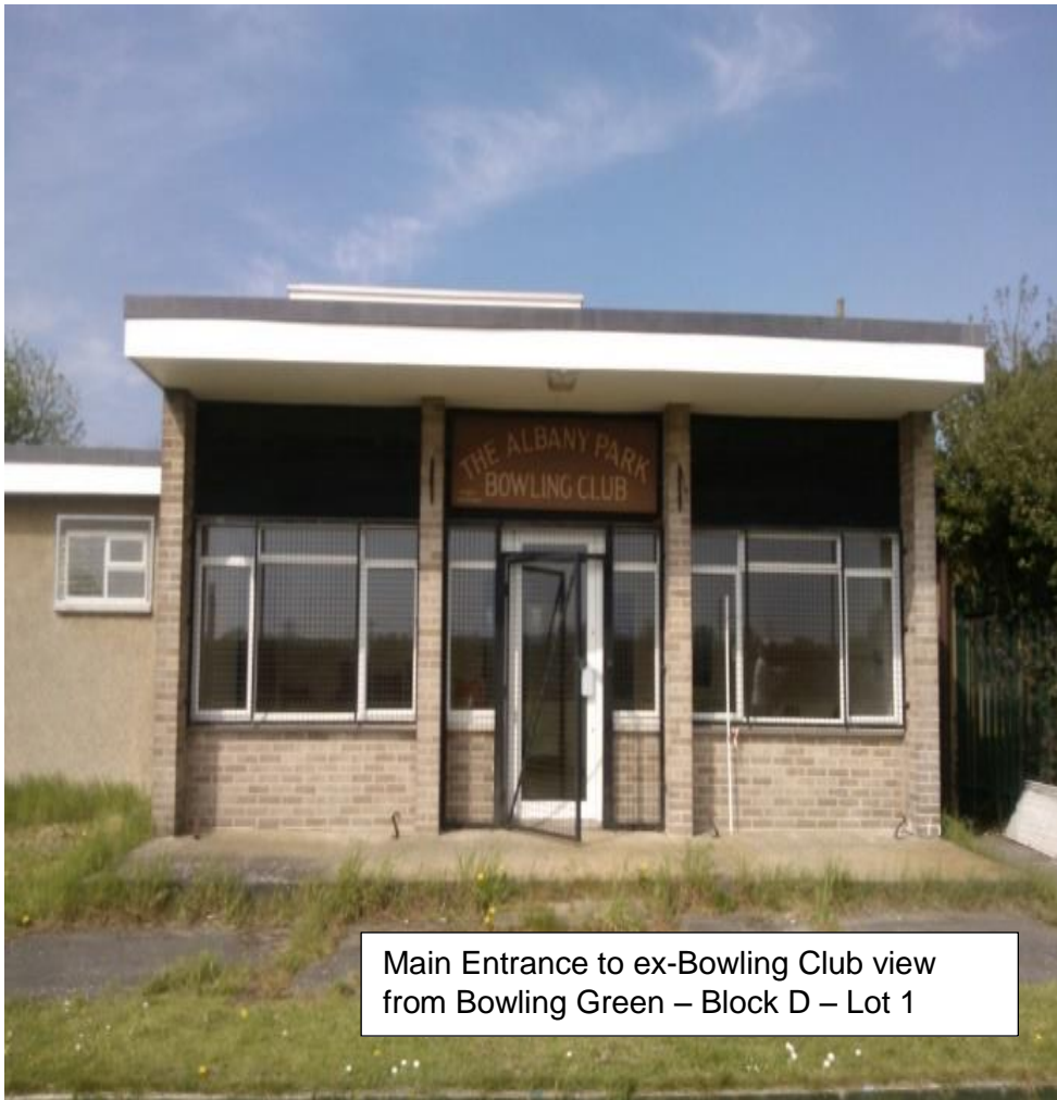
Main Entrance to ex-Bowling Club view from Bowling Green – Block D – Lot 1