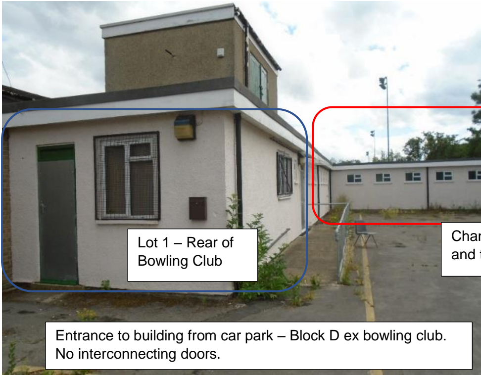
Lot 1 – Rear of Bowling Club