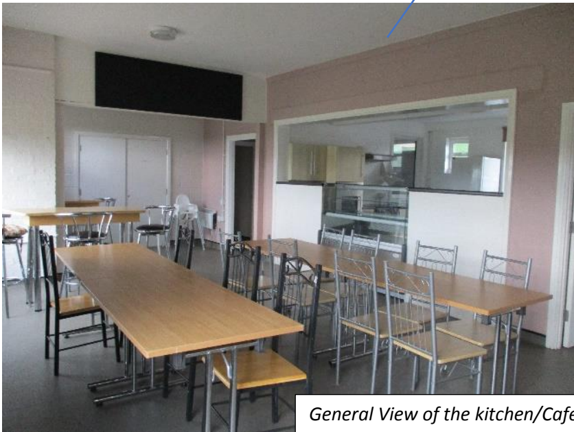
General View of the kitchen/Cafe Area – Block D

Main Entrance to ex-Bowling Club view from Bowling Green – Block D – Lot 1. Included.